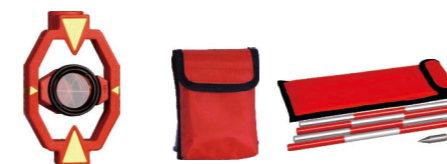
Mini Prism System TPSmini112A