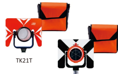
Single Prism Set