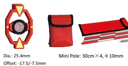
Dia.: 25.4mm Mini Pole: 30cm × 4, φ 10mm Offset: -17.5/-7.5mm